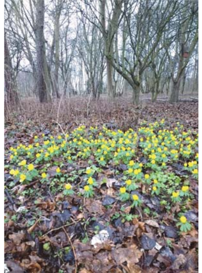
Spring at the Landbeach Lakes

All our waters are fishable on the purchase of a club book or day ticket with the exception of Leland Water where pre booking is the only way to obtain